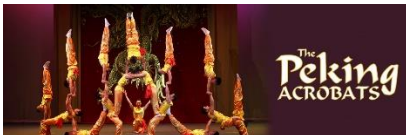
The Peking ACROBATS