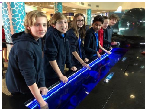
Delta students enjoyed a fieldtrip to the Florida Aquarium on January 29.