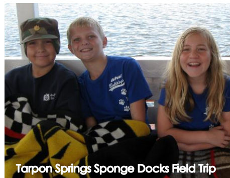
Tarpon Springs Sponge Docks Field Trip